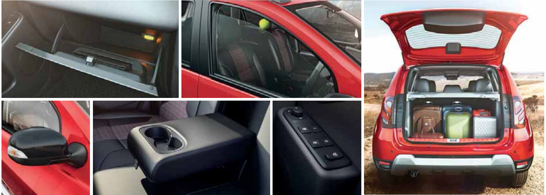
Additionally, features like illuminated glove box, the innovative anti-pinch window and electrically adjustable & foldable ORVMs with turn indicators are built-in for convenience. The generous boot space of 475 litres, expandable up to 1064 litres, assures plenty of space for fun.