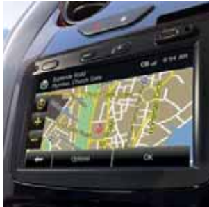
GPS satellite navigation