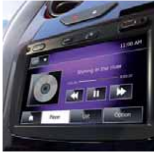
Dynamic multimedia player