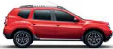
New Fiery Red