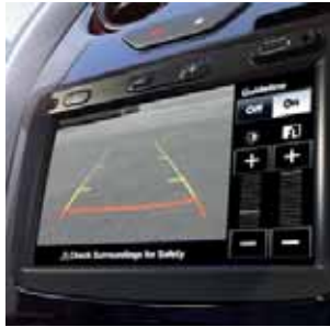
Reverse parking camera with guidelines