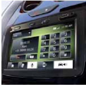
Phone control via Bluetooth®