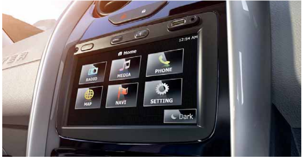
Touchscreen infotainment system

The first-in-class MediaNAV ensures an entertaining and relaxed drive. The touchscreen infotainment display features radio, USB and Aux-in connectivity and GPS navigation as well. The MediaNAV also eases your driving experience by enabling hands-free calling. Now wherever you go, stay connected.