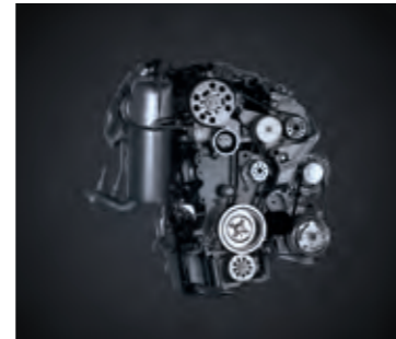
1.2L MPI Petrol Engine