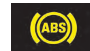
Anti-lock Braking System (ABS)

Rated the Safest Premium Hatchback in its segment in India