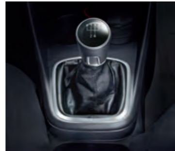
5-speed Manual Transmission