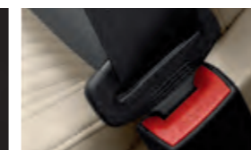
3-point Seat Belts