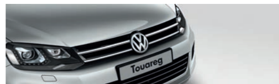
Cool silver metallic