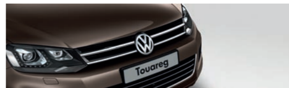
Graciosa brown metallic