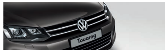
Galapagos anthracite metallic