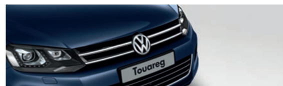
Night blue metallic