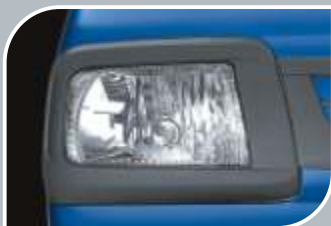
MAGNIFICENT CLEAR-LENS HEADLAMPS