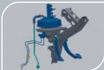
BOOSTER ASSISTED FRONT DISC BRAKES FOR ADDED SAFETY