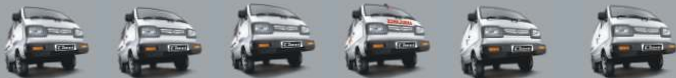
OMNI 5 SEATER