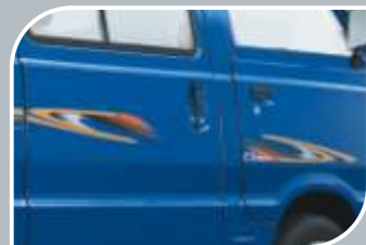
SLEEK SIDE-BODY GRAPHICS