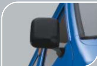
BIGGER AND BETTER OUTSIDE REAR-VIEW MIRRORS