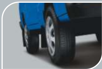
ROBUST RADIAL TYRES FOR EXTRA STRENGTH AND DURABILITY